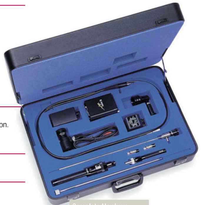
Complete Hawkeye Barrel Inspection Station.

Hawkeye Barrel Inspection Station $4,395.00 F.O.B. Rochester, New York