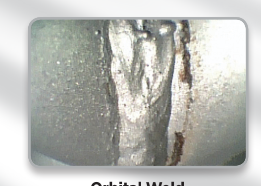
Orbital Weld (Using a 90° Prism Tip)