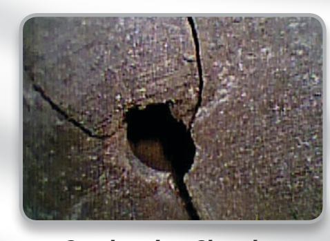
Combustion Chamber (Using a Close-Focus Tip)