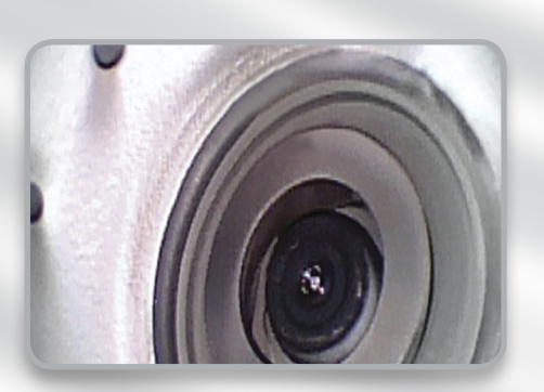
Aircraft Combustion Chamber