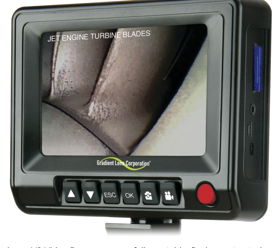
Hawkeye® V2 Video Borescopes are fully portable, finely constructed, and deliver clear, bright high resolution photos and video! The 5" LCD monitor allows comfortable viewing, and intuitive, easy-to-use controls provide photo and video capture at the touch of a button! V2's have a wide, 4-way articulation range, and are small, and lightweight. V2's are available in both 4 and 6 mm diameters. Optional 90° Prism and Close-Focus adapter tips.